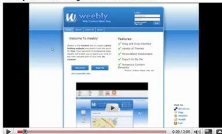
Weebly Demo - Amazing Online Website Creator