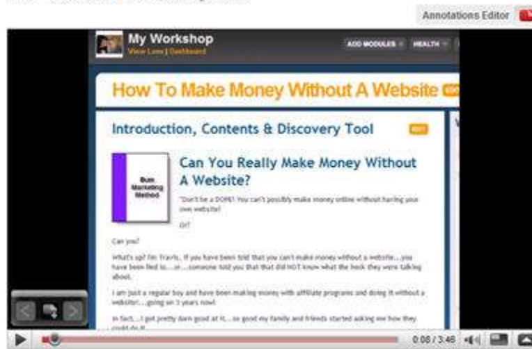
How To Add A Link To Squidoo